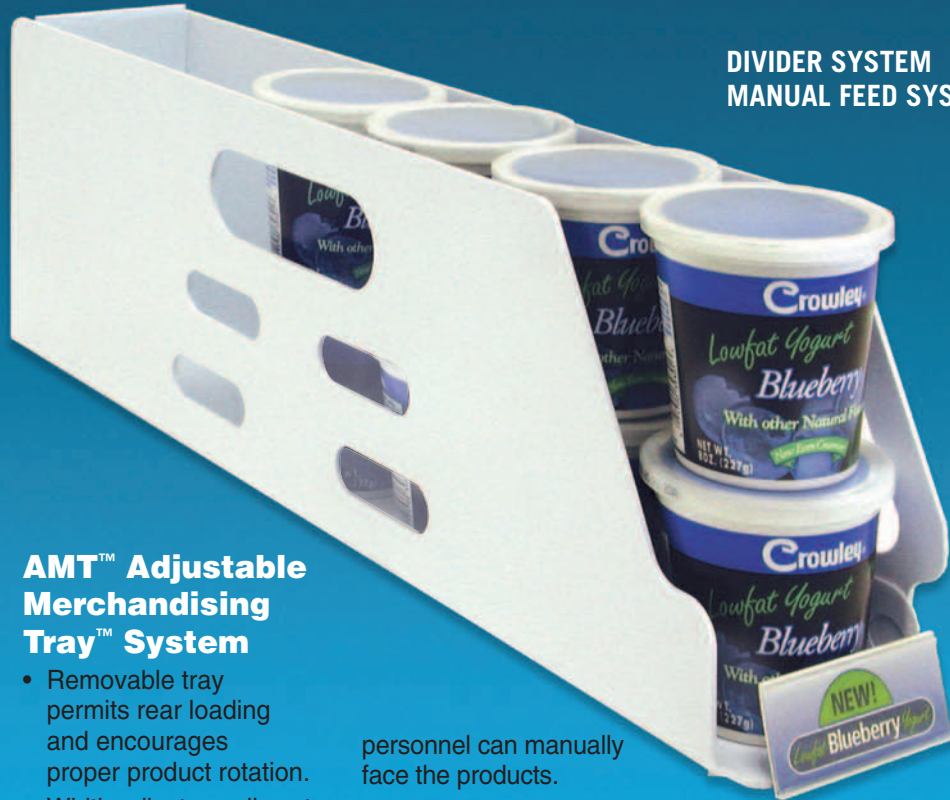
DIVIDER SYSTEM MANUAL FEED SYSTEM