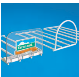
Clear, Imprinted or Open Wire Front Product Stops

The standard wire finish is zinc galvanized.