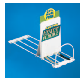
Top Header Signs

Extensions available to tailor system to larger product sizes. White, other colors available.