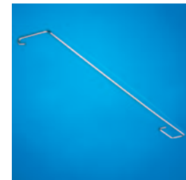
Inventory Arm/Facing Tool

Various tape widths and locations are often possible to satisfy unique needs.